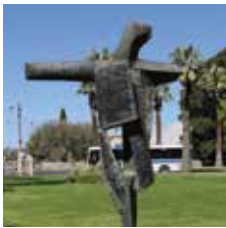
Geoff Sharples Figure , 1964. Beaten copper.

8. Do you think it looks like a figure? Has anything happened to the bronze over time?