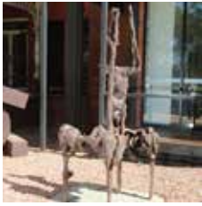
Bert Flugelman Equestrian , 1966. Cast iron.

1. Outside, between Rio Vista Historic House and the cafe sits Equestrian .