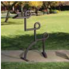
Don Gore Dazee's Chant , 1982. Steel.

13. Discussion Ideas Abstract means: when something doesn't look quite like any person or object. Do you think this sculpture is abstract?