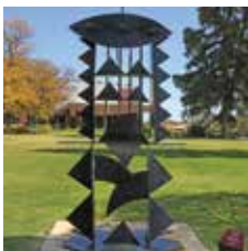
Diego Latella Crest II , 1998. Painted steel.

10. Discussion Ideas What repetitive shapes you can see in this sculpture? How many can you count?