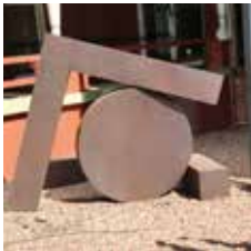
Reg Parker Untitled 2/75 , 1974. Steel.

2. To the left of Equestrian is Reg Parker's sculpture.