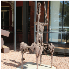
Bert Flugelman Equestrian , 1966. Cast iron.