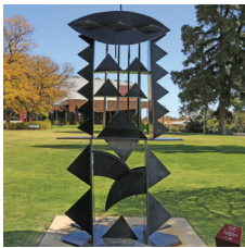
Diego Latella Crest II , 1998. Painted steel.

10. Discussion Ideas What repetitive shapes you can see in this sculpture? How many can you count?