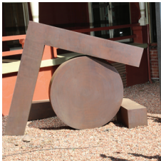
Reg Parker Untitled 2/75 , 1974. Steel.