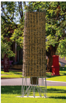
Vlasé Nikoleski "Beehave" 1988. Steel, cane and ciment fondu.