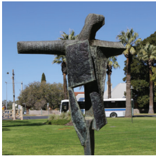
Geoff Sharples Figure , 1964. Beaten copper.

8. Do you think it looks like a figure? Has anything happened to the bronze over time?